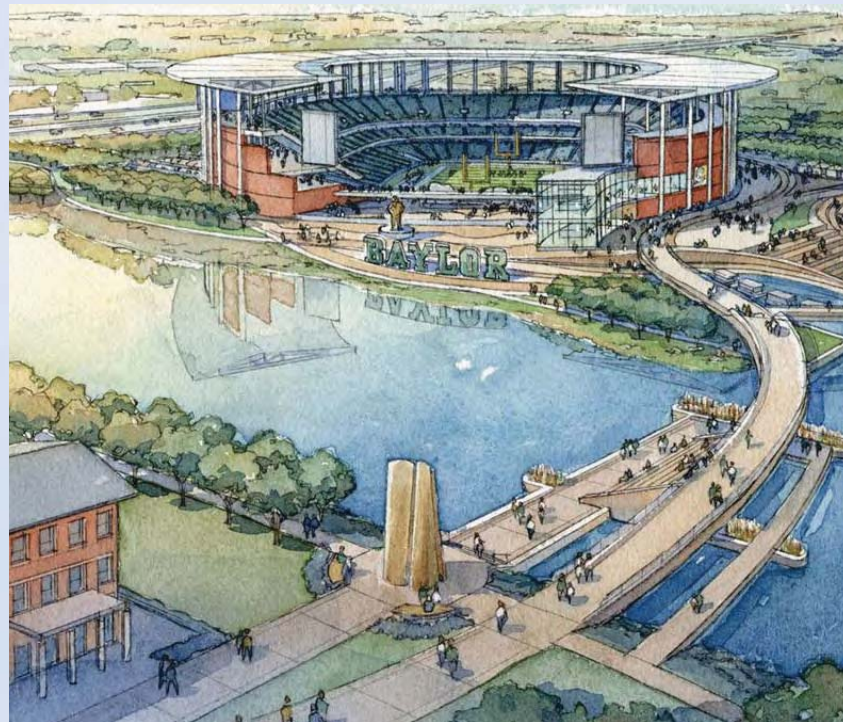
Conceptual rendering by Populous

Baylor University has released an architectural rendering of an on-campus riverfront football stadium that would connect both sides of the river. The preferred location for the proposed stadium is adjacent to Interstate 35 where more than 100,000 vehicles travel each day providing a unique opportunity for exposure for Baylor and Waco.